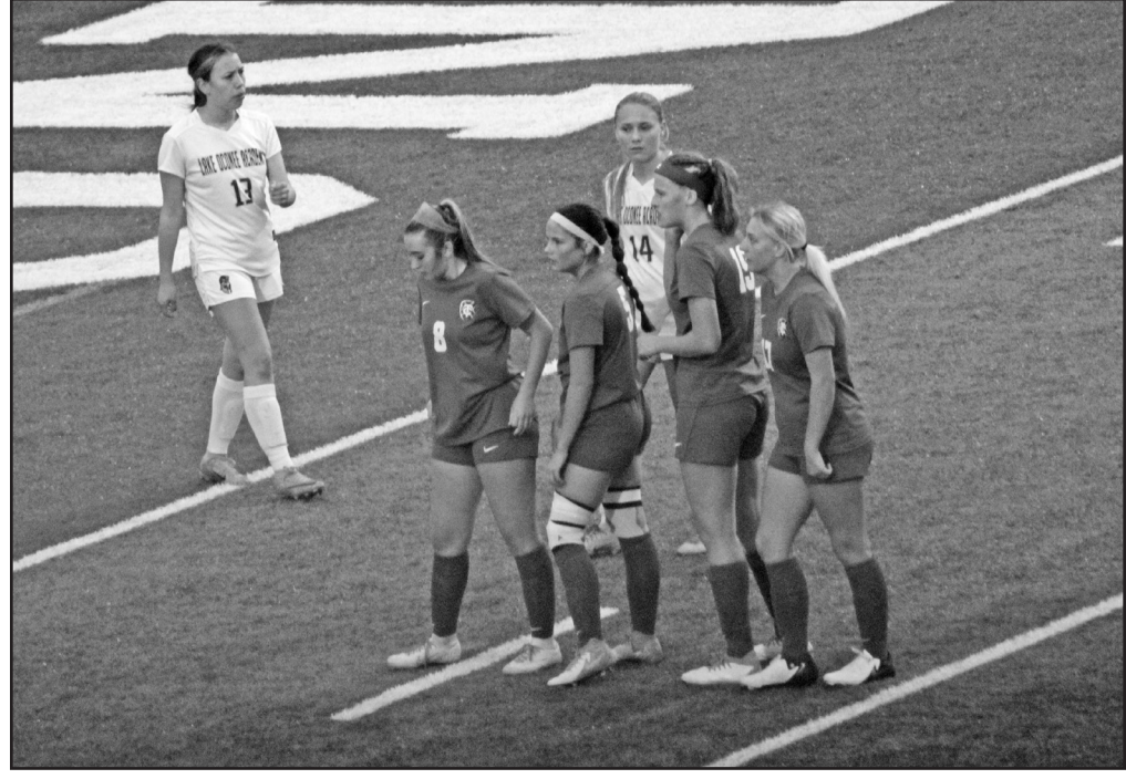
Lady Indians in action vs. LOA on Friday, March 15.